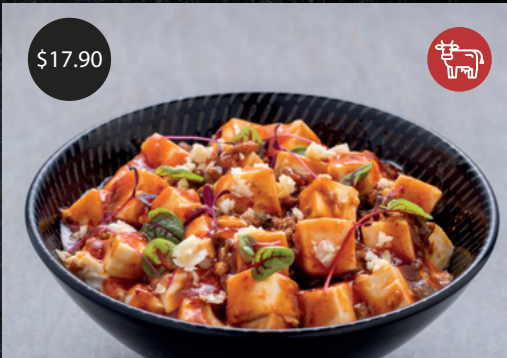
Wagyu Beef Mapo Tofu Don Minced Wagyu Beef, Silken Tofu, Garlic, Spring Onion, Beef Fat Rice

Sawayaka Avocado Negitoro Don Otoro, Akami, Avocado, Onsen Egg Yolk, Spring Onion, Yaki Nori, Kizami Dakuan Radish, Yuzu Zest, Sushi Rice