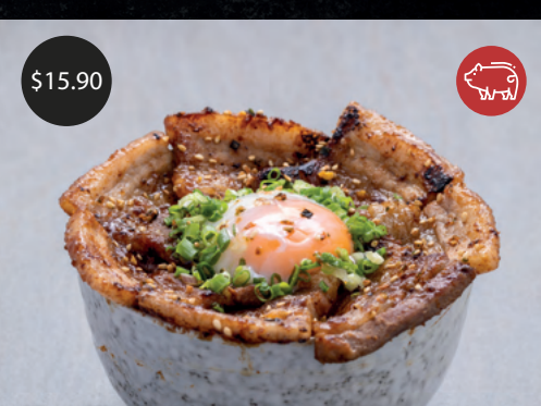
Kara Miso Buta-Yaki Don Kurobuta Pork Belly, Onion Slices, Onsen Egg Yolk, Togarashi, Spring Onion, Beef Fat Rice