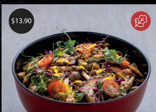
Truffled Trio Mushroom Don Shiitake Mushroom, Shimeji Mushroom, Eringi Mushroom, Onion, Truffle Paste, Shoyu Rice

Bara Chirashi Don is available in Original and Spicy option, view the details on our delivery platforms. Prices subject to prevailing GST for delivery orders. Prices are subjected to prevailing GST and Service Charge for dine-in orders.